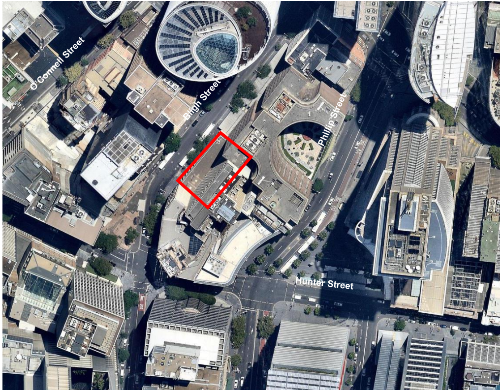
Figure 1 Site context plan Site outlined in red

The site in its context is illustrated in Figure 1 below.